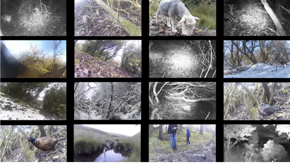
Fig. 4. The animal footage displayed as a grid.

Imaging technology, from the microscope to the telescope, has greatly expanded the capacity of human vision while helping to advance scientific research. It has also helped the artist to see other elements of the land beyond a conventional vision. Two infrared and motion-sensitive cameras were placed inside and around the rhododendron bushes in the area, which then captured movements in front of them when triggered. What they revealed was what a rich community of animals thrive in the area including badgers, foxes, deer, rabbits, hares, mice, pheasants, magpies, woodcocks, curlews, and herons (see Figure 3 and Figure 4). Such insights into the wildlife of the area transformed the photographer's perception towards the site's landscape and its ecology. Instead of a wasteland, it is in fact a land full of life and opportunities. The presence of the animals also helped to decentre the photographer's (and by extension, humans') position within the land. We share it with the animals and the plants. We do not own it, neither should we have the sole voice over it.