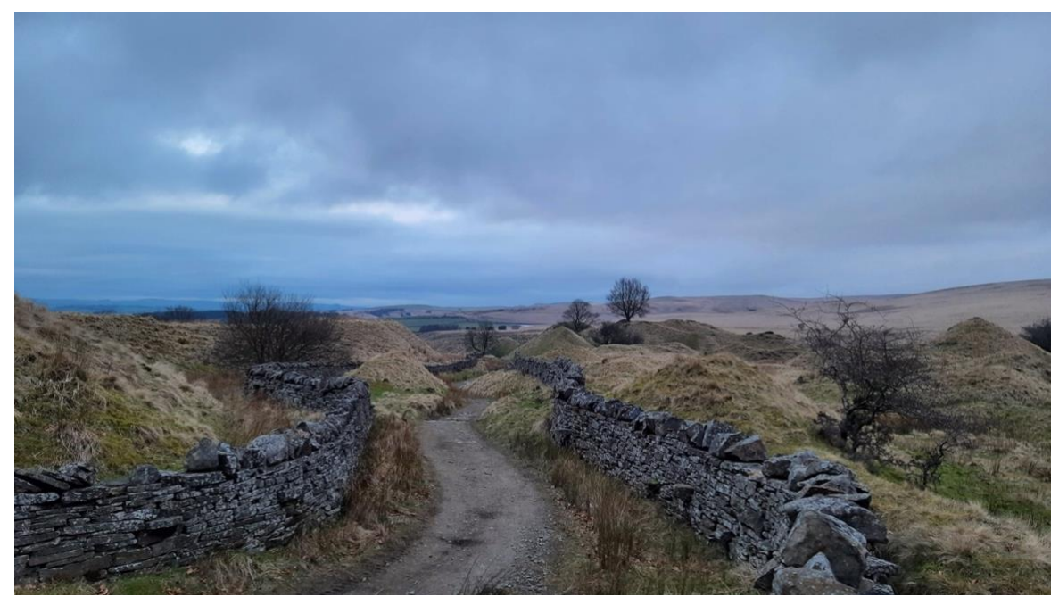
Fig. 7. Topography at Sheddon Clough.

Whilst wind sounds provide a sense of large-scale landscape, there are also very close recordings of breaking ice, the movements of rocks at the site, and capturing insects from within the rhododendron ponticum bush itself. Such changes of sonic perspective enhance the transition from season to season. The sense of 'intimacy' demonstrated in the 'winter' section by focusing on very closely recorded breaking ice correlates to the sound dampening experienced due to heavy snowfall in the area. This sense of intimacy is further emphasised by the spatial characteristics and unique topography of the environment—the ice formed on streams at the bottom of gullies. Coupled with snowfall there were few auditory reflections from the hard dry-stone walls around the site.