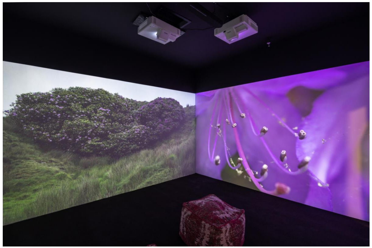
Fig. 5. With Love. From an Invader. Installation view at Jeddah Photo 2022.

The four ways of looking described above are all anchored within the documentation function of photography. They all make use of contemporary imaging technology, from high-resolution digital cameras to low-budget infrared and motion-sensitive cameras, to 1:1 ratio macro-filming camera, and to the APP-controlled action cameras. Yet each camera's human-centric and linear views form a multi-angled vision that helps to dislodge the observer from the central stage. Instead, they provide an intimate experience in which the viewer is firmly placed inside the rhododendron bushes. Meanwhile, the content of the images and films serve as visual data and evidence, presenting a thriving ecology and habitat rich in fauna and flora.