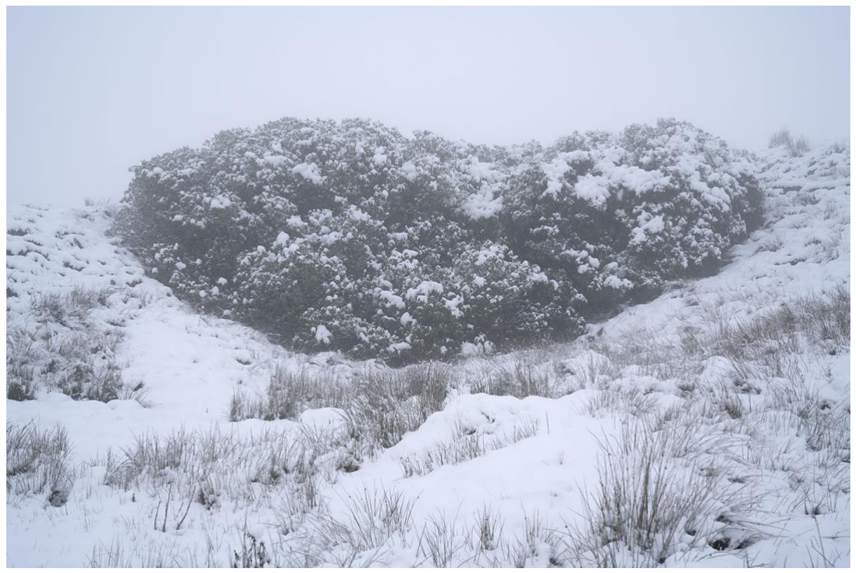
Fig. 2. With Love. From an Invader. Walk No. 130. 04 December 2020. ©Yan Wang Preston

The photographic vision and modern science share much in common. Both emphasize a human-centric and linear perspective. Both share a naturalised yet mythic authority in being detached, rational, and objective. The long-established notion of the photograph as a document implies to us that to see is to witness and to photograph is to provide evidence. Meanwhile, just like the privilege and power enjoyed by scientific knowledge over other forms of knowledge and knowing, the visual has been given the absolute priority over other senses, such as hearing, smell, and touch. The latter are typically relegated to the 'tribal', the 'feminine', and the 'less intellectual' (Cosgrove, 2002; Howes, 2004). Such emphasis on the vision, the view, as well as the scientific knowledge has largely influenced our ways to perceive, construct and manage the physical landscapes.