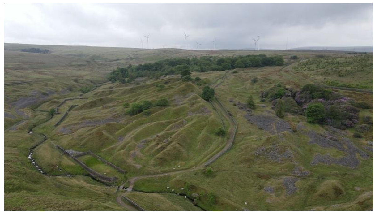
Fig. 8. Aerial topography at Sheddon Clough.

It is clear in the ice section (at c.25-32mins) that there is human intervention in which surface ice on the stream is broken. The sound recordist becomes bodily-present in the installation through causal action rather than passive quasi-neutrality of the recorded environments. In the studio these ice recordings were further isolated from their environmental context and recombined with low and high frequency sine tones to clear out the middle-ground sonic space to give a sense of isolated emptiness. The deliberately close microphone techniques used in the ice recordings,