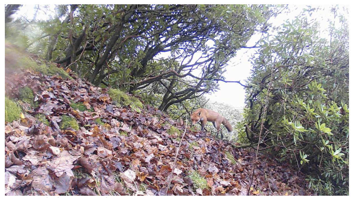
Fig. 3. A fox filmed by the infrared camera in between two rhododendron bushes, 17 November 2020.

Imaging technology, from the microscope to the telescope, has greatly expanded the capacity of human vision while helping to advance scientific research. It has also helped the artist to see other elements of the land beyond a conventional vision. Two infrared and motion-sensitive cameras were placed inside and around the rhododendron bushes in the area, which then captured movements in front of them when triggered. What they revealed was what a rich community of animals thrive in the area including badgers, foxes, deer, rabbits, hares, mice, pheasants, magpies, woodcocks, curlews, and herons (see Figure 3 and Figure 4). Such insights into the wildlife of the area transformed the photographer's perception towards the site's landscape and its ecology. Instead of a wasteland, it is in fact a land full of life and opportunities. The presence of the animals also helped to decentre the photographer's (and by extension, humans') position within the land. We share it with the animals and the plants. We do not own it, neither should we have the sole voice over it.