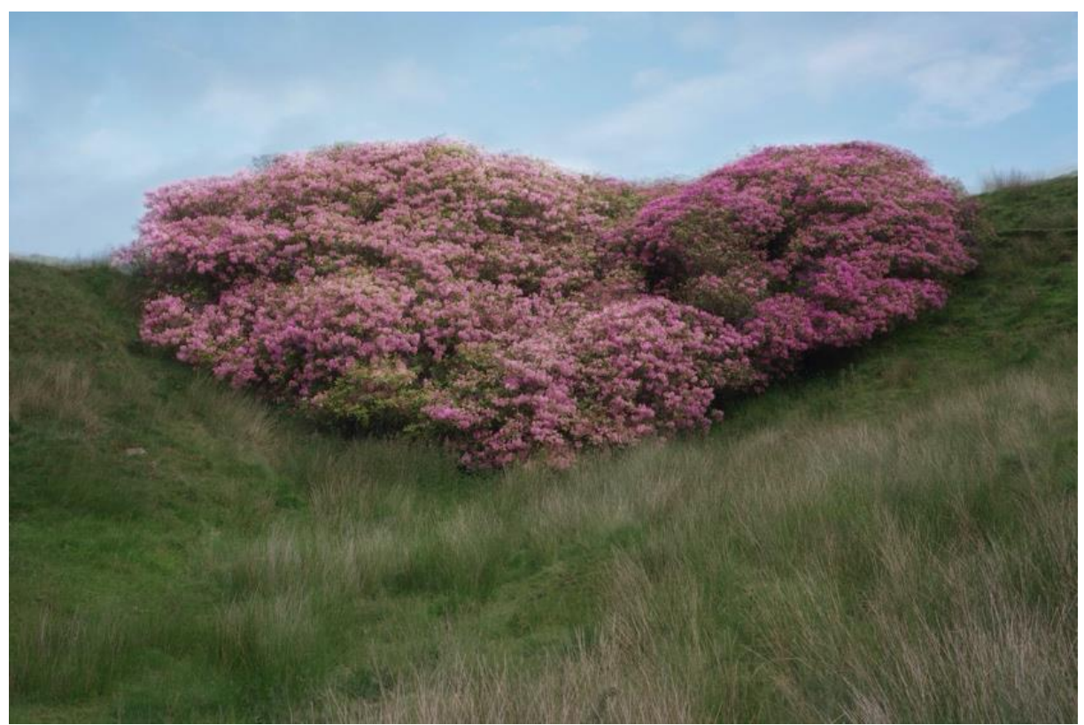
Fig. 1. Rhododendron bush at Sheddon Clough.

With Love. From an Invader. is the start of a long-term project investigating the complex connections between landscape representation, identity, migration and the environment. For this piece, Yan Wang Preston walked every other day to the same love-heart-shaped rhododendron bush at Sheddon Clough, Burnley, Lancashire, UK (see Figure 1), from 17th March 2020 to the 16th March 2021. A photograph of the rhododendron was taken every two days, in an identical manner, always at half an hour before sunset.