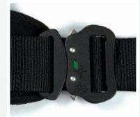
Automatic aluminum buc- kles with locking indicator