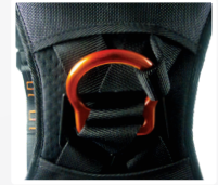
Orange coated back D ring

Padded leg straps with adjustment through automatic buckles