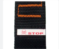
Activated fall indicator