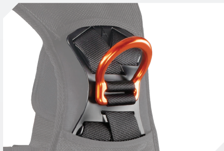
BACK FALL ARREST ATTACHMENT POINT WITH ALUMINUM D RING