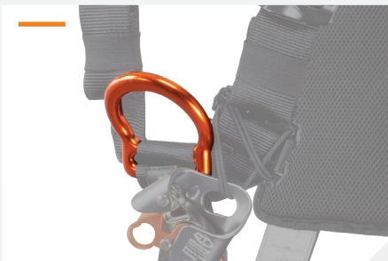
FRONT FALL ARREST ATTACHMENT POINT WITH ALUMINUM D RING