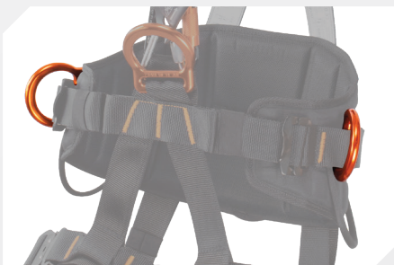
LATERAL ATTACHMENT POINTS WITH ALUMINUM D RING FOR WORK POSITIONING