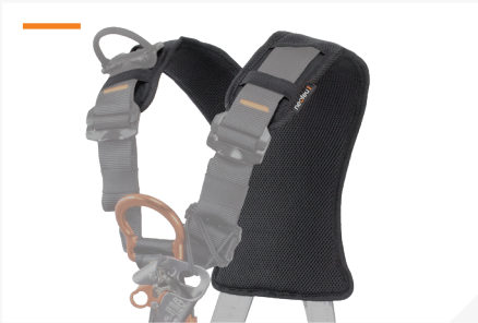
BACK PAD WITH BREATHABLE 3D FABRIC