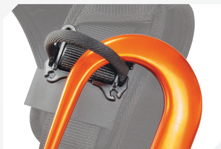
REMOVABLE LANYARD HOLDER