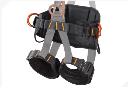
LARGE LEGS AND POSITIONING BELT WITH BREATHABLE 3D FABRIC