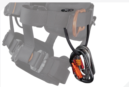
TOOL HOLDERS(X2) + LARGE TEXTILE STRINGS FOR TOOL HOLDING (X3)