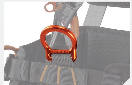
VENTRAL SUSPENSION ATTACHMENT POINT BY ALUMINUM D RING