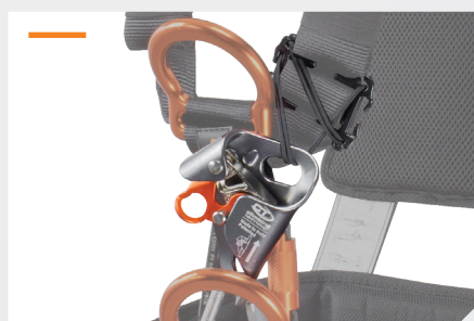
INCLUDED ASCENDER ADJUSTER REF. NUS131A + OPTIONAL VENTRAL ASCENDER REF. NBLOCK